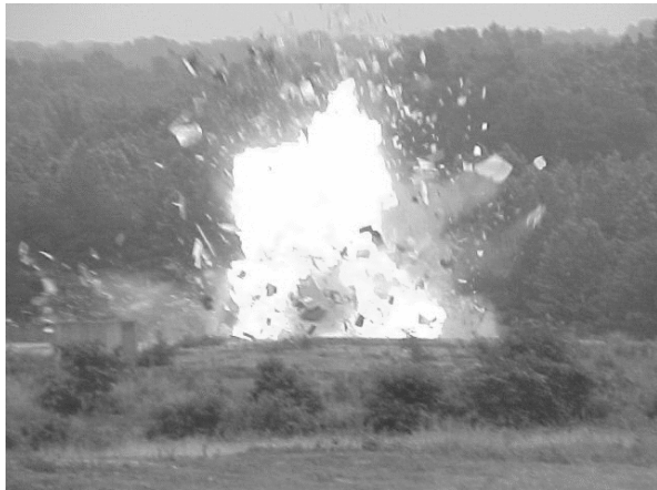
The effect of detonating 50 lbs. of TNT in a motor home

Once we understand how explosives work, we can better organize the collection of evidence at a crime scene. Tasks at a major bomb scene, which can range from providing toilets for the crime scene workers to bagging evidence, can involve as many as two to three hundred people. The lessons learned from New York, Oklahoma City, Dhahran, Nairobi, Dar es Salaam and Aden have brought about a system of evidence collection that centers around the Evidence Response Team (ERT).