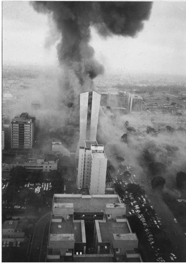
Nairobi, Kenya, August 7, 1998