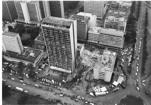
United States Embassy, Nairobi, Kenya, August 7, 1998

expertise and resources to create court room exhibits. The Coordinating Examiner can arrange for the preparation of these items.