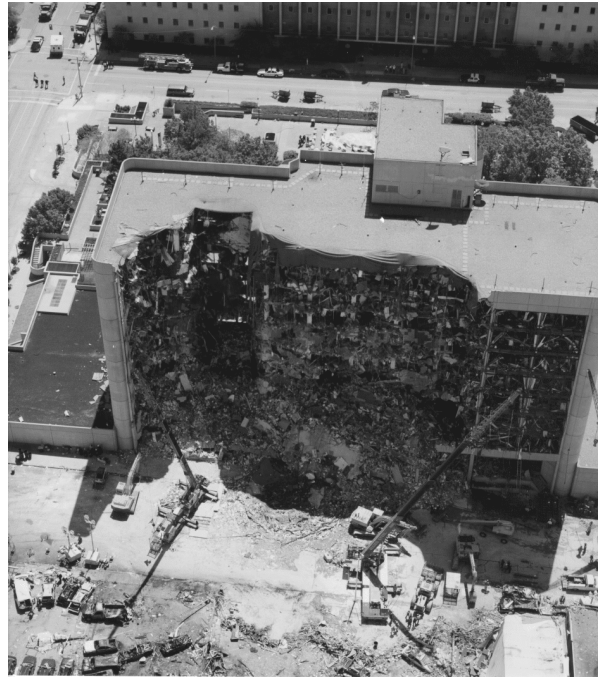
The Alfred P. Murrah Federal Building, Oklahoma City

vehicle may initially be overlooked or moved. Even after evidence is found to classify an incident as a criminal act, and a crime scene is established, the rescue of the injured takes precedence over the collection of physical evidence.