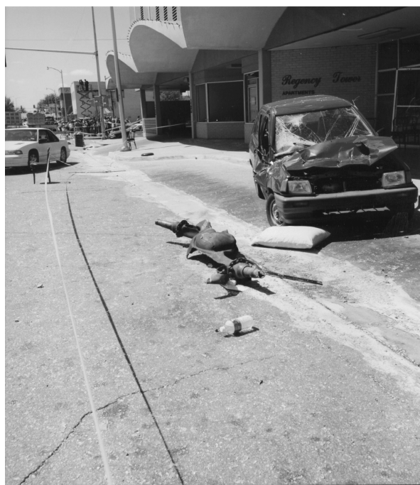
Axle from the bomb truck at Oklahoma City, located about 200 yards from the crater

The solution to this problem is a joint investigative task force, working in close cooperation with the United States Attorney and local prosecuting authority. Under Presidential Decision Directive 39 (PDD 39), signed by President Clinton on June 21, 1995, the FBI serves as the lead investigative agency when a terrorist incident is suspected. PDD 39 also provides a framework for involvement by other federal investigative agencies, as well as local police forces. Many FBI field offices have Joint Terrorism Task Forces (JTTF) already in place, incorporating relevant agencies under one roof. These JTTFs help to ease the transition when a local disaster incident becomes a federal crime scene.